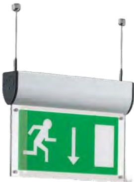
EX1/M3 with EX/WIRE kit